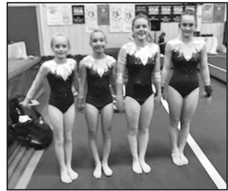
USA Level 4