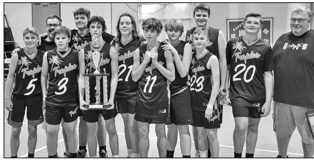
The 8th grade Tropics local basketball team repeated as Fannin County Christmas Clash champions.

The Tropics are made up of 8th-graders from Towns, Union and Fannin counties and Andrews, North Carolina. This is their second year competing in the tournament and are now